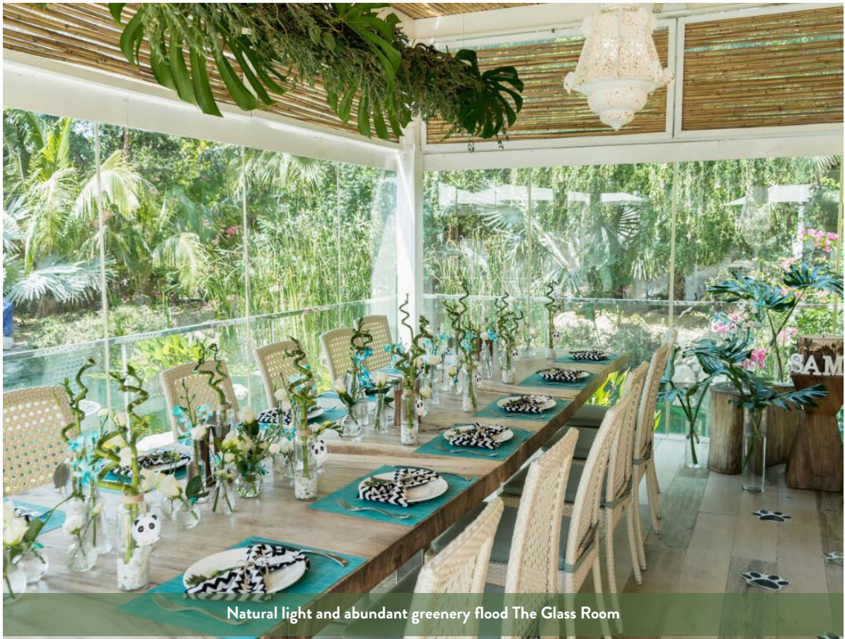
Natural light and abundant greenery flood The Glass Room